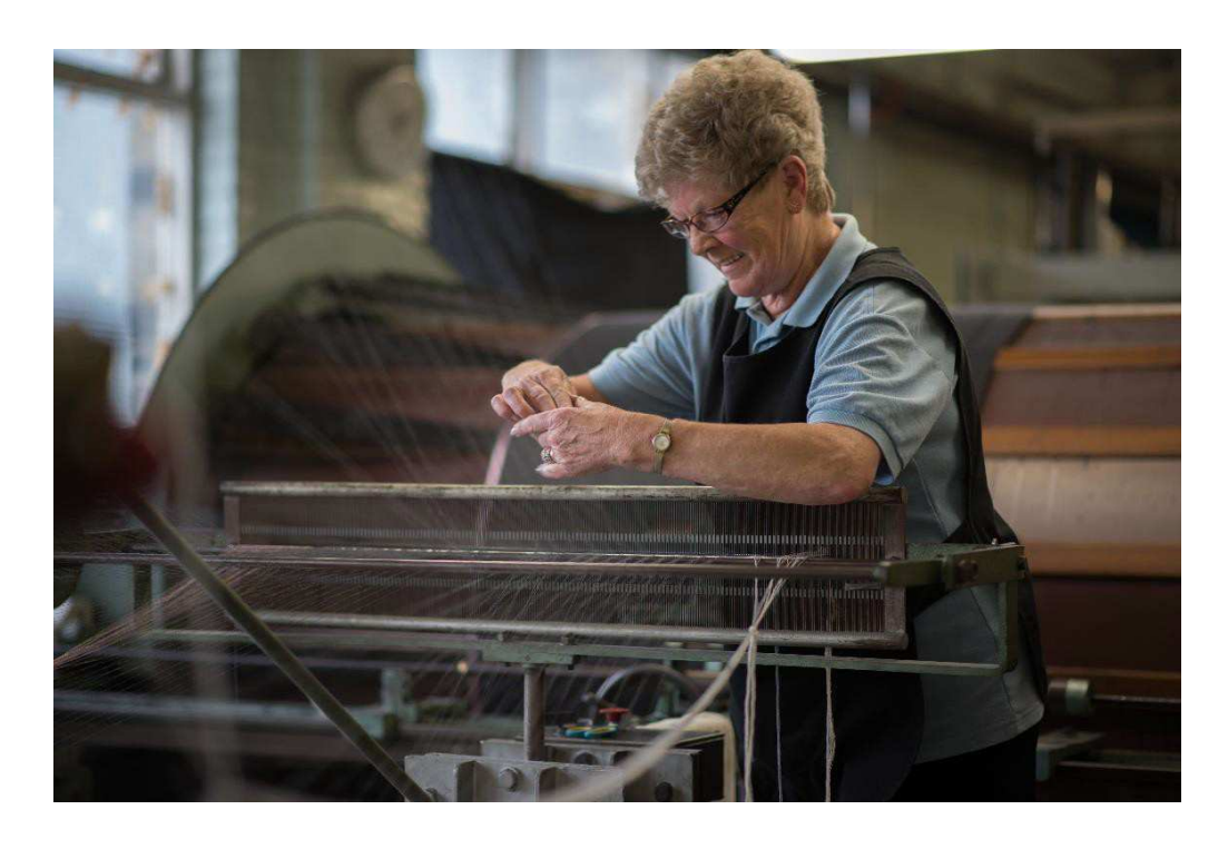
Figure 1. Worker on loom, Abbotsford.

These businesses are supported by a range of other operations delivering fibre processing, spinning, weaving, dyeing and finishing. The opportunity for students to access so many different areas of regional manufacturing and gain and understanding of industry as opposed to artisan craft was invaluable.